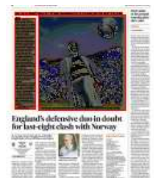
↑ Lilian Thuram shows he has not lost his touch as he plays keepie uppie after receiving his honorary doctorate yesterday.